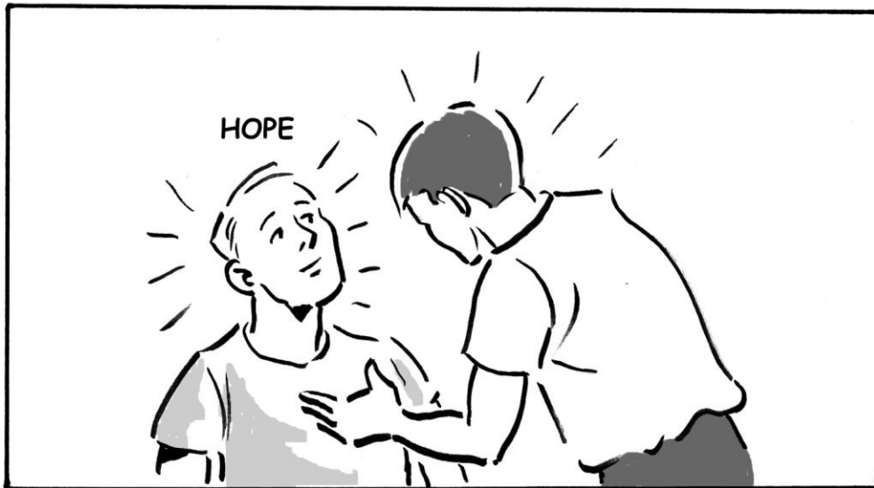
A CHRISTIAN WITNESSING IN HUMILITY, COMPASSION AND LOVE.